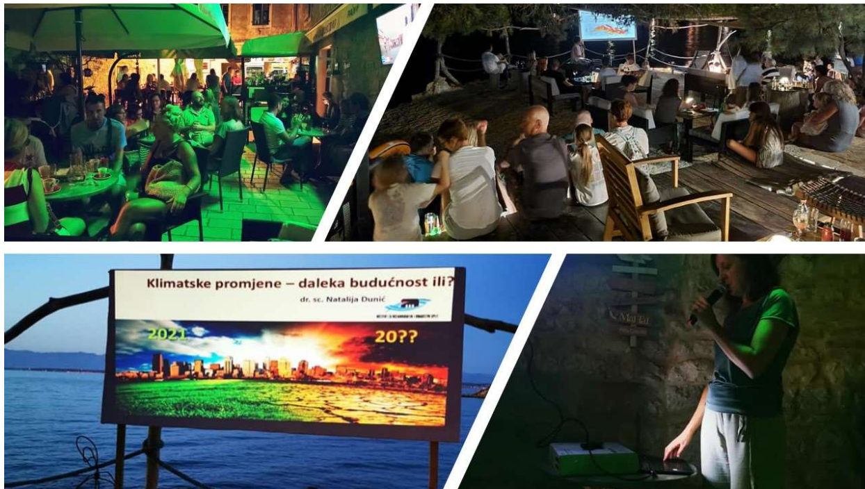
The "Adriatic Sea in café" – our lectures in Preko and Vrboska in summer 2021