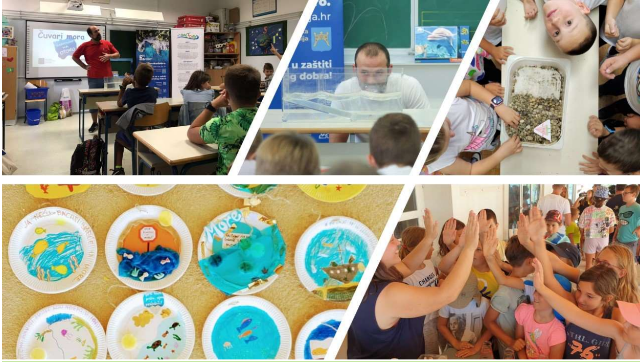
Collage of our activities with children