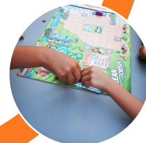
Social and board games