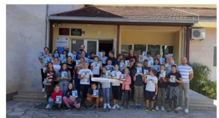
Collage of our activities with children