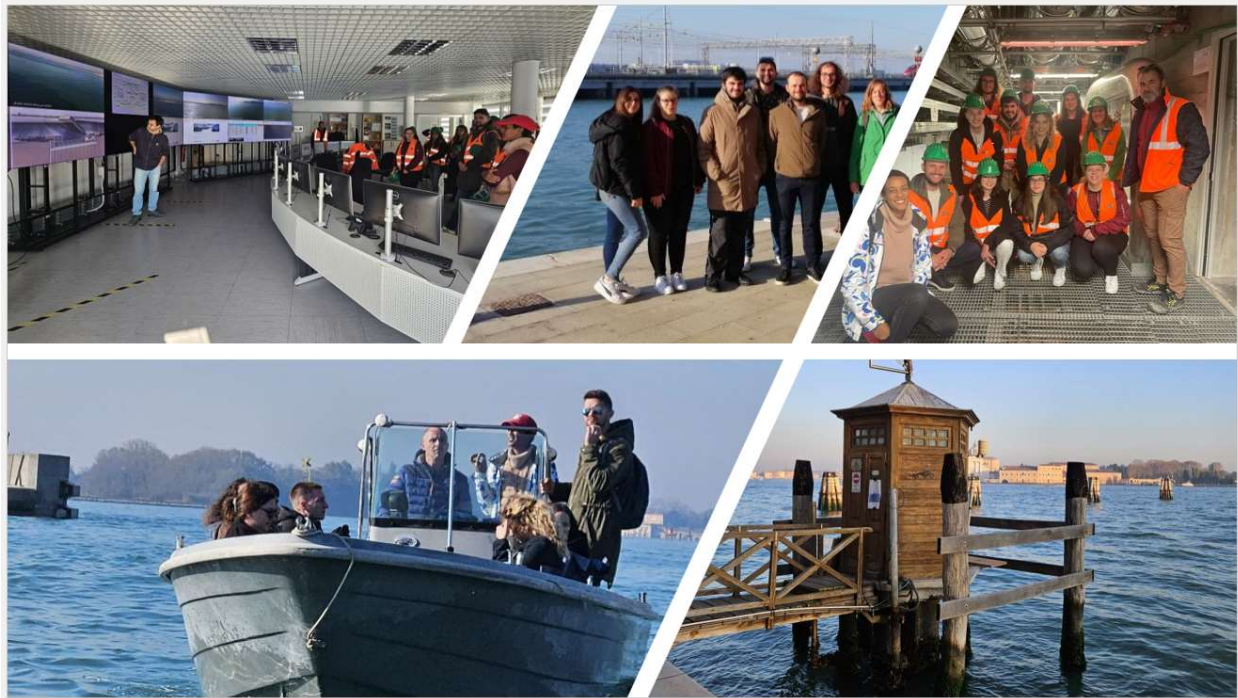
With students in Venice: Visite to MOSE control centre and tunnels, cruise in the lagoon, and Punta Salute – the oldest tide gauge in Venice